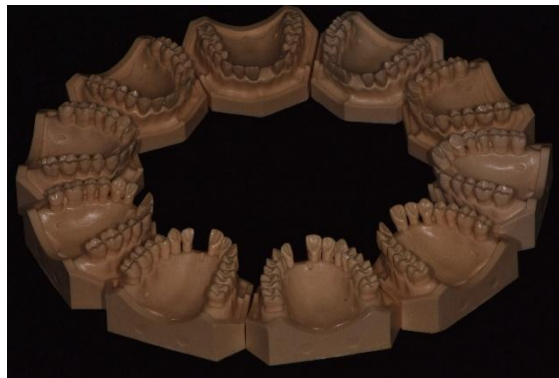
Figure 1 Ten drillable polyurethane maxillary models

Then the surgical guided templates were fabricated by 3D printing (Dental Prime, Stratasys, Rehovot, Israel) (Figure 2).