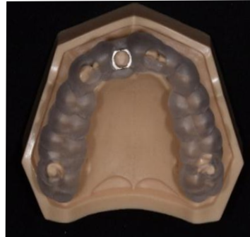
Figure 2 Surgical guided template