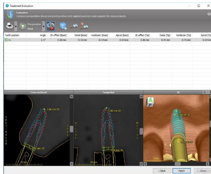
Figure 4 Treatment evaluation of indirect method. Blue line represented planned implant position, Red line represented placed implant position generated from scan body